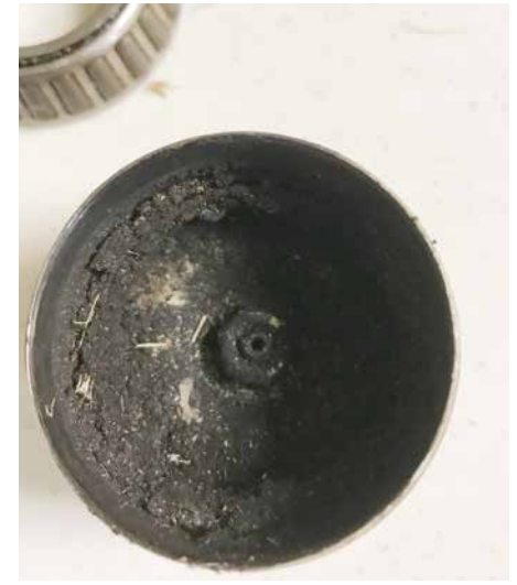
Above: Bearing buddy from seasonal usage.