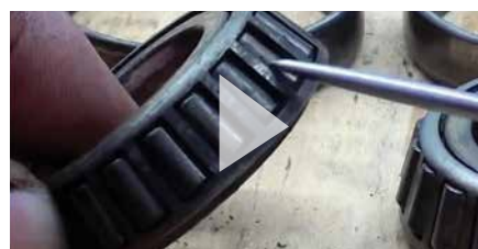
Right: Close inspection of and cleaning of bearing.

Boats and trailers don't maintain themselves. Just like anything sails and sheets, bearings and trailers need to be maintained too.