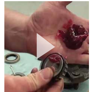
Left: Fisherman and mechanic in his helpful instructional videos on this topic. Right: Packing the bearings with grease.

I found these helpful videos on YouTube from a fisherman and mechanic in Arkansas.